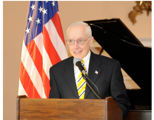
U.S. Attorney General Michael Mukasey delivers his keynote address to a packed house at the Atlanta Chapter's Annual Luncheon Honoring the Federal Judiciary on June 17, 2008